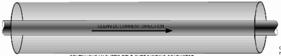
CONTINUOUS MAGNETIC FIELD SURROUNDING CONDUCTOR

Continuous, the magnetic field surrounding the conductor. Start